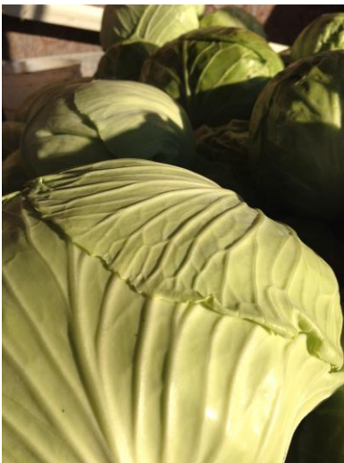
Beautiful Cabbages, time to make sauerkraut!