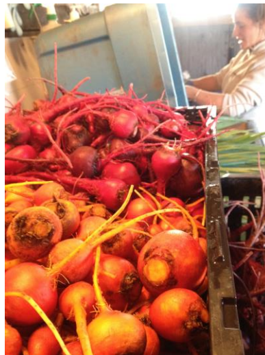
Prepping your veggies